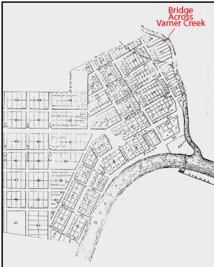
Early Plat Map of East Columbia with no lots laid out east of Varner Creek 7