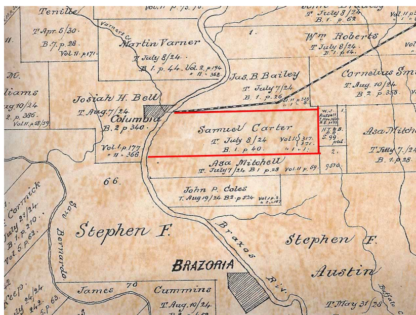
Samuel Carter League Map 1879 The General Land Office of the State of Texas